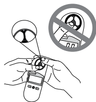
Replacing the Impeller

You may recalibrate the wind speed readings by replacing the impeller. Press FIRMLY on the sides of the black impeller housing with your thumbs to remove the entire assembly. When inserting the new impeller, be sure the arrow is facing the display side of the unit, and is aligned with the top of the meter. Press on the sides of the housing rather than the center.