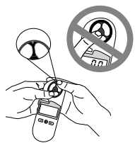
Replacing the Impeller

You may recalibrate the wind speed readings by replacing the impeller. Press FIRMLY on the sides of the black impeller housing with your thumbs to remove the entire assembly. When inserting the new impeller, be sure the arrow is facing the display side of the unit, and is aligned with the top of the meter. Press on the sides of the housing rather than the center.